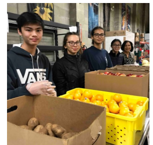
St. Joseph the Worker's youth at the Richmond Food Bank

what their interests/ concerns are. Continue to use the organizing methods of the Metro Vancouver Alliance (MVA)