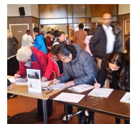
Petition for Supportive Housing

"We who have a voice must speak for the voiceless" -Saint Oscar Romero