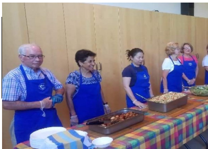
Serving meals at St. Alban's