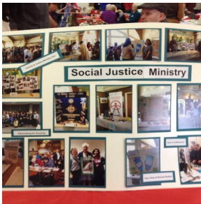
Display from the 2018 Fall Fair