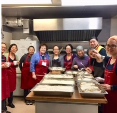
Preparing Meals at Richmond Baptist