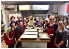
Serving meals at Richmond Baptist