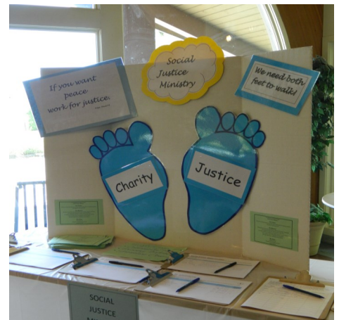
Display at the Ministry Fair